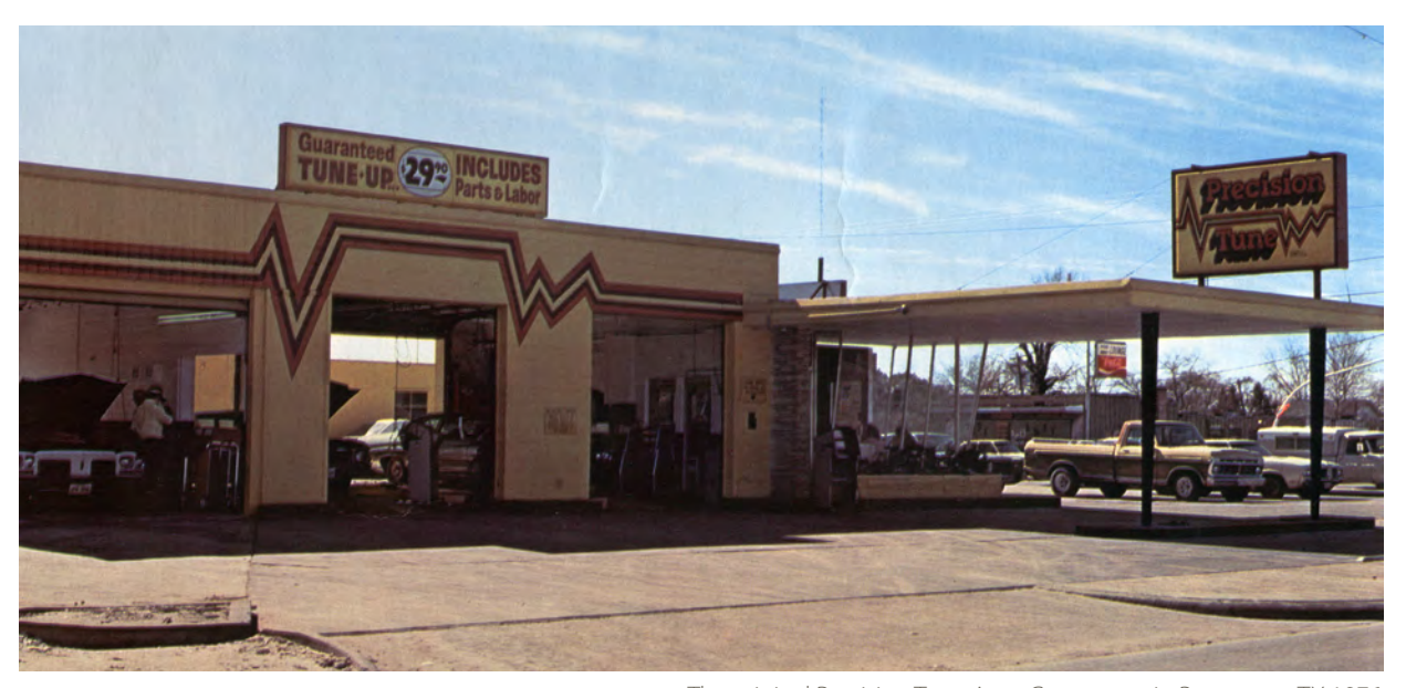
The original Precision Tune Auto Care center in Beaumont, TX 1976

Regardless of the competition, our model has been proven to work in small and large towns from California to Virginia. Precision Tune Auto Care has positioned itself as the alternative to the dealership while providing convenience, expertise and the best value for today's consumer.